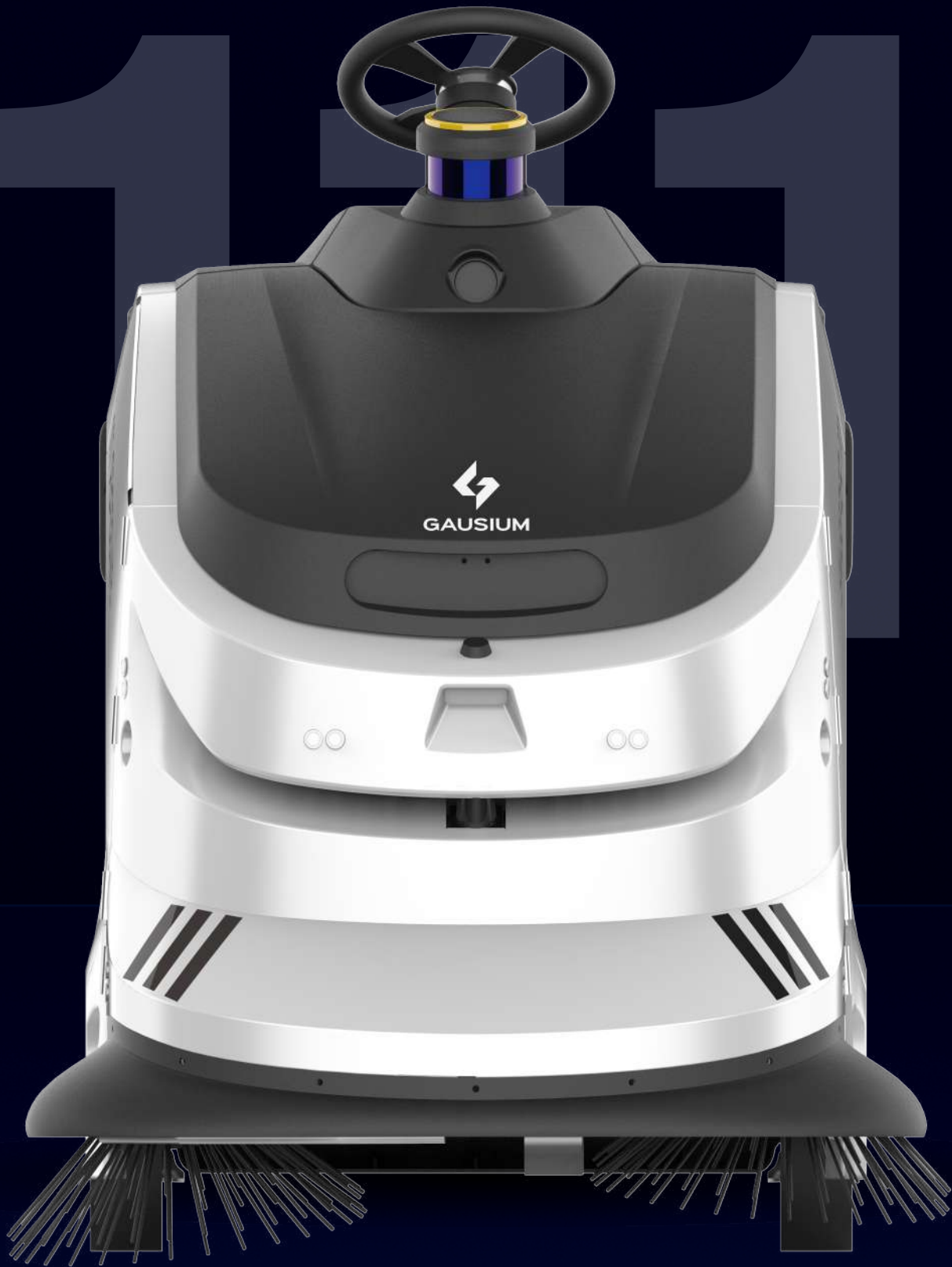
Sweeper 111 High Performer, Whether Indoors or Outdoors